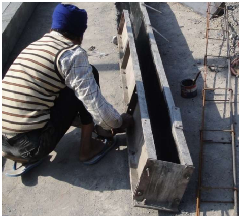
Fig. 1 Beam section and reinforcement details